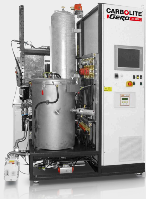
LHTW 200-300/22-1G automatic up to 2200°C with optional hydrogen package