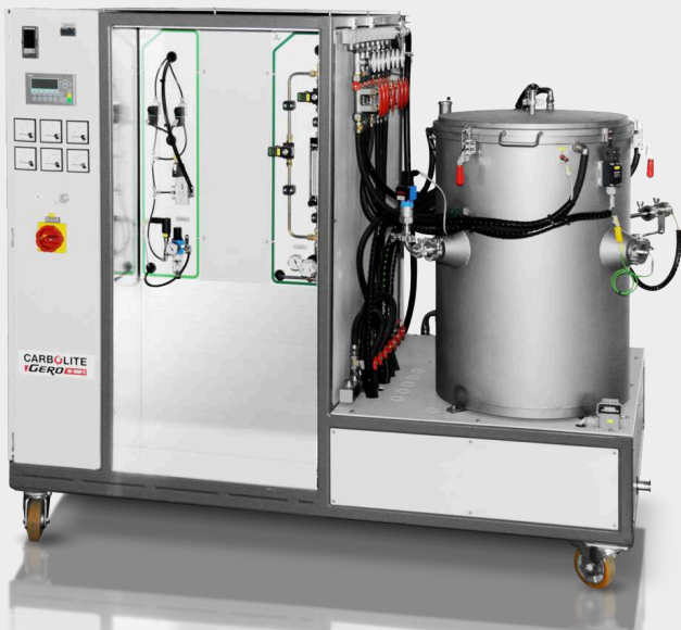
LHTW 200-300/22-1G semi-automatic up to 2200°C