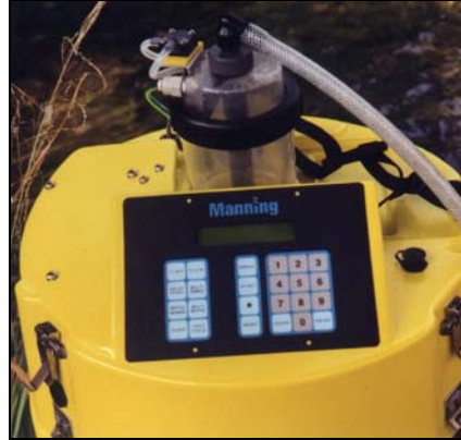
Manning VST Sampler Control Panel

Most sampler manufacturers and other experts agree a critical, if not the most critical, factor in obtaining a representative sample is the sampler transport velocity. Unlike most peristaltic samplers, the VST has a transport