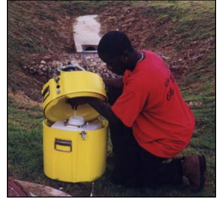
VST Sampler Bottle Placement

The VST can be used for a wide range of sampling needs from heavy influent to critical storm water or combined sewer overflow sites. The larger 5/8-inch internal diameter (ID) intake option is recommended for applications with potential clogging problems or large solids. It is ideal for liquids containing hard organic matter, which harmlessly pass through the sample tract and into the bottle, preventing expensive repairs and critical failures. The lightweight VST can be easily transported to remote sites or used at fixed locations.